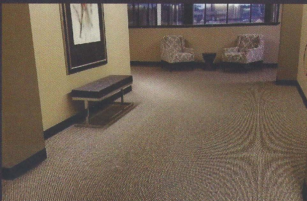
Elevator landing for the 3rd floor

We understand that building a thriving non-profit on your own is hard work. At the M.A.D. Office Suites, you'll be working along side a seasoned and dynamic team of ministry leaders like yourself. Joining us will not only afford you the resources you need, but give you the strength of like-minded individuals who are all "Making A Difference"!