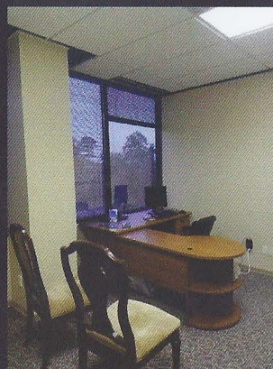
Typical office space all nicely furnished