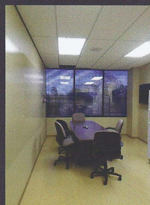
One of our 2 conference rooms seats 8 with AV setup