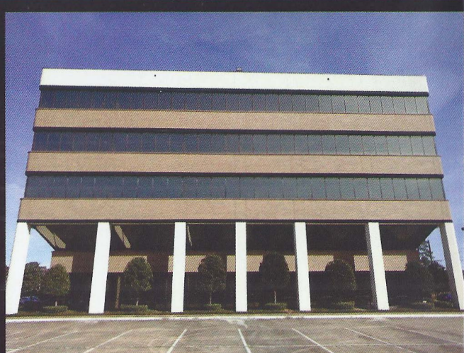
Outside front of building

We offer a warm, contemporary environment where you and your team can collaborate. You can be proud to hold meetings here with potential donors or partners. We have options for every budget from co-op space to private offices.